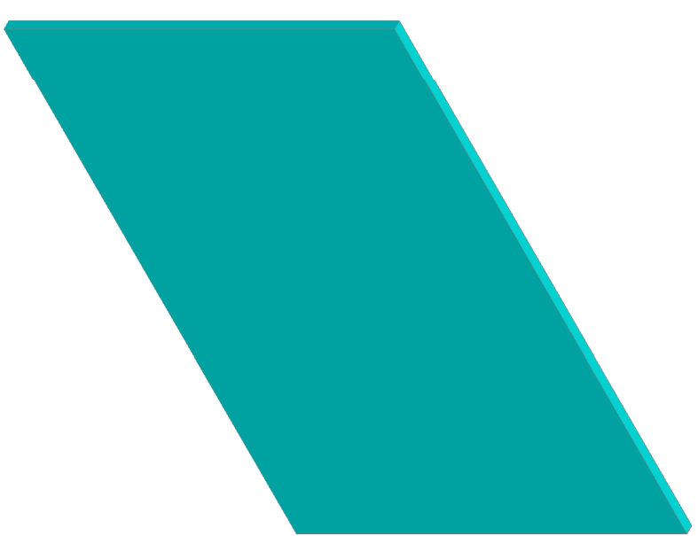
ISOMETRIC VIEW OF THE BOARD